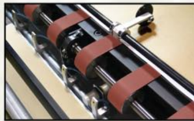
Front Tamper System w/ Air Nozzles